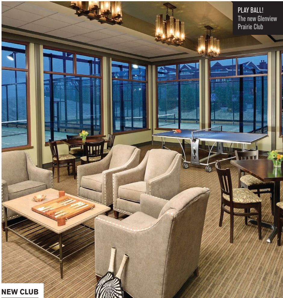
PLAY BALL! The new Glenview Prairie Club