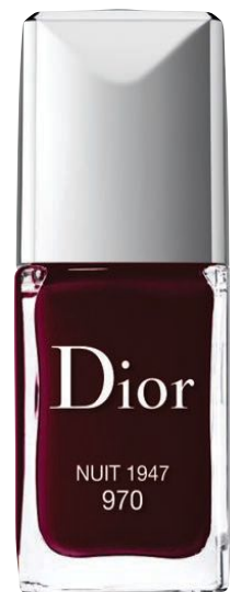
Rouge Dior Vernis nail lacquer in Nuit 1947, $24, by Dior at Macy's