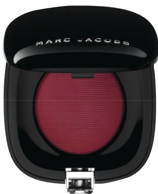
Shameless Bold Blush in #218 Tantalizing, $30, by Marc Jacobs Beauty at Sephora