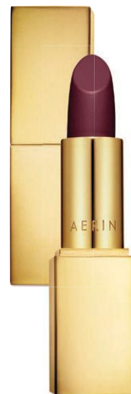
Lipstick in Mercer, $30, by AERIN at Saks Fifth Avenue