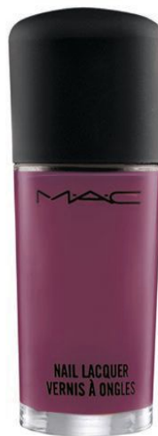
Indulge nail lacquer in #300 Rebel, $16, at M·A·C counters