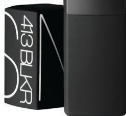
Lipstick in #413 BLKR, $26, by Nars at narscosmetics.com